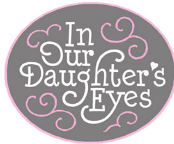
Logo for a custom children's line of clothing. For use on tags, stationery and business cards