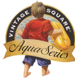
Series of logos used in various fence product brochures